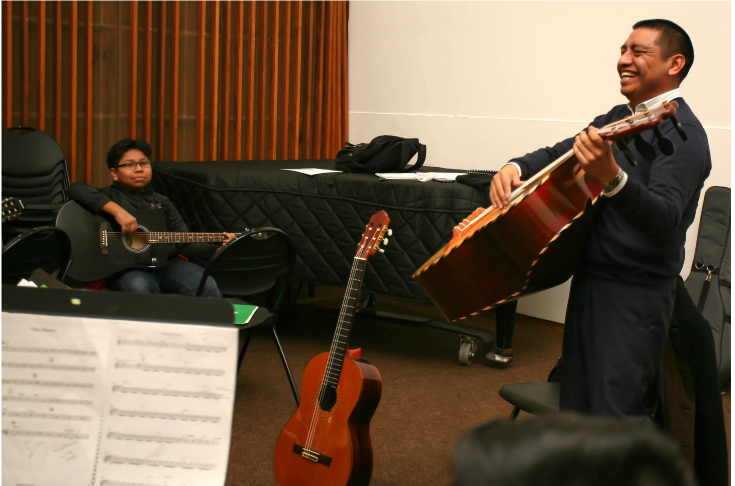
Students learn guitar at the Mariachi Academy of New York.

communities, sharing traditions, mentoring the next generation, and performing in community settings. When they are not touring internationally or performing at premier venues like Lincoln Center, immigrant artists and groups like the New York Crimean Tatar Ensemble of Borough Park and the Queens-based Mariachi Real de Mexico lead arts and cultural organizations dedicated to supporting and serving immigrant artists and audiences.