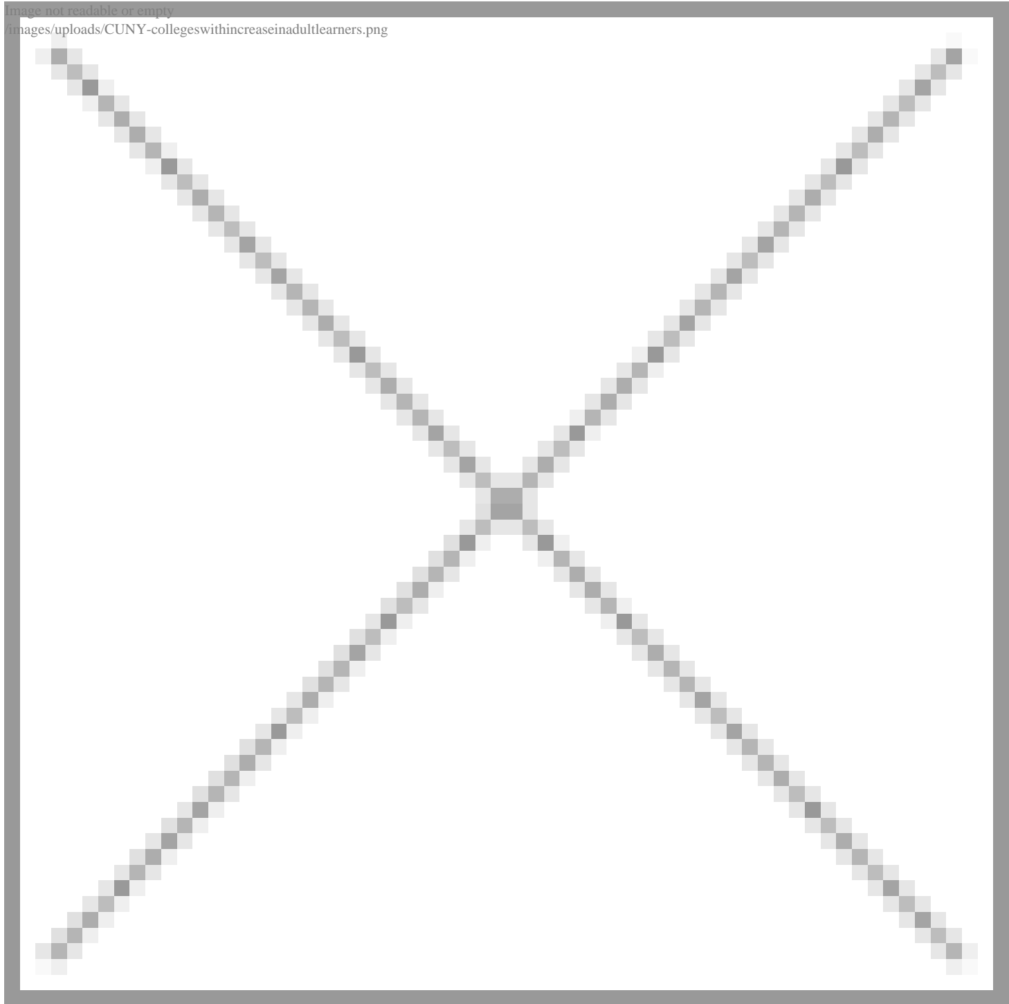
Image not readable or empty /images/uploads/CUNY-collegeswithincreaseinadultlearners.png